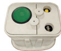
Vault for ST-1600-B system