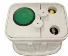
Vault for ST-1600-B system